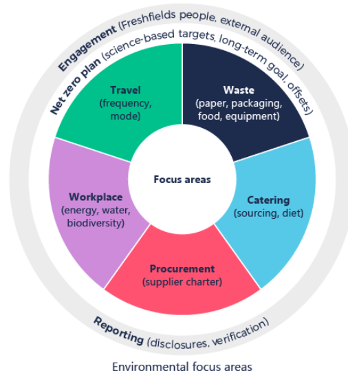
Diagram 2: Freshfields' Global Environmental Framework including focus areas

Our medium-term environmental planning typically spans 2-5 years, which is used to monitor progress against interim targets. This view covers our near-term science-based targets (which currently complete in 2027) and other interim targets (e.g. paper reduction) to be met in 2025. Our long-term environmental planning horizon spans 5-25 years, incorporating our work to define a long-term net zero target date for the firm.